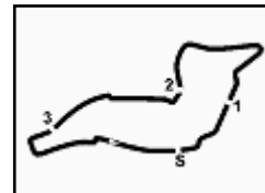
Enzo e Dino Ferrari 4.936 m